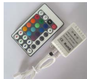
28 keys RGB LED controller

◆ Remark: The adapter to finally choose appearance models prevail.