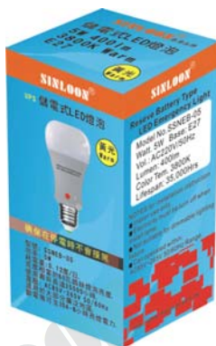
Gift box 1 pcs